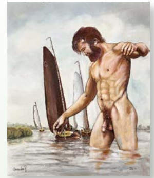
'IN REUS FOAR IT SKÛTSJE FAN GROU'